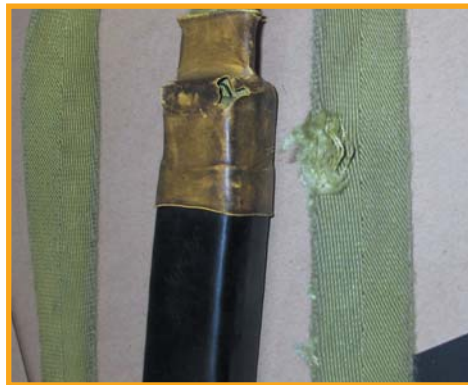
Figure 1 Damaged webbing and protector to energy absorber

The following photographs show lanyards that have been withdrawn because of damage suffered during use.