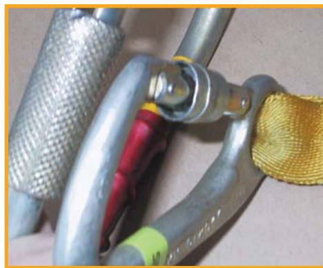
Figure 7 Damaged gate on karabiner