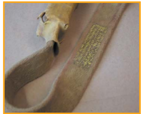
Figure 8 Missing label: damage to protective sleeve over energy absorber