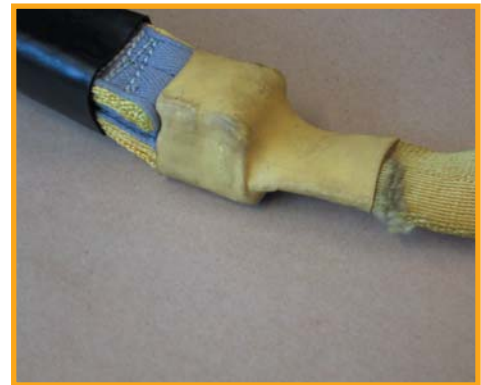
Figure 2 Abrasion damage adjacent to energy absorber: displaced protective sleeve over energy absorber