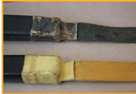
Figure 5 Two similar products with unknown history – the top webbing is heavily soiled

Remember: When checking or inspecting lanyards think WEBBING – STITCHING – HARDWARE