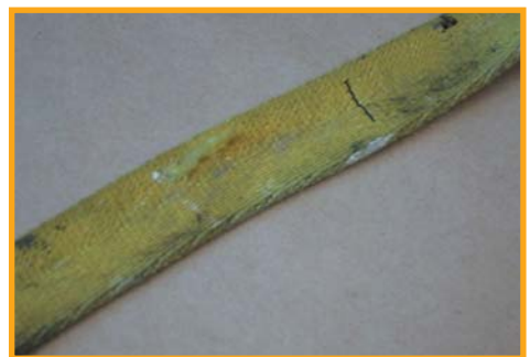
Figure 4 Surface fibres damaged by abrasion