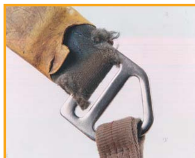
Figure 3 Wear at end of absorber loop at connection