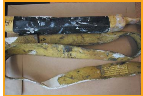
Figure 6 Heavy paint contamination to webbing